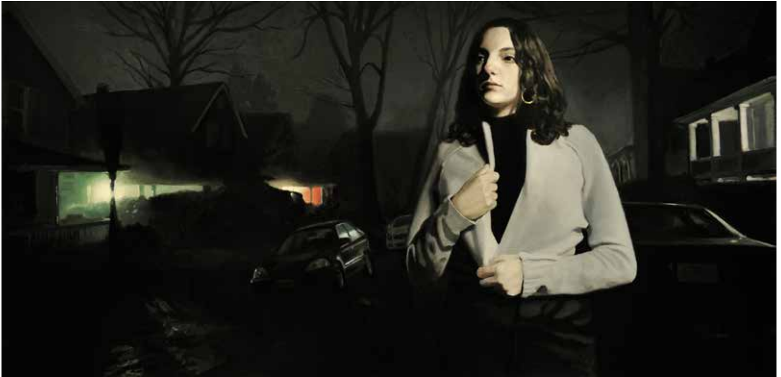
Zachary Thornton , Streetlight 4, Öl auf Leinwand, 51 x 102 cm

I continue to find visual inspiration in the night: the eerie lighting, the silent trees and glowing houses, the looming darkness and quietly ominous solitude. The figures who appear in this ambiguous atmosphere embody a separate and private realm of internal conflict, a world within a world; revealing just enough of themselves to arouse curiosity, leaving the viewer to pursue their identity, situation, and purpose.