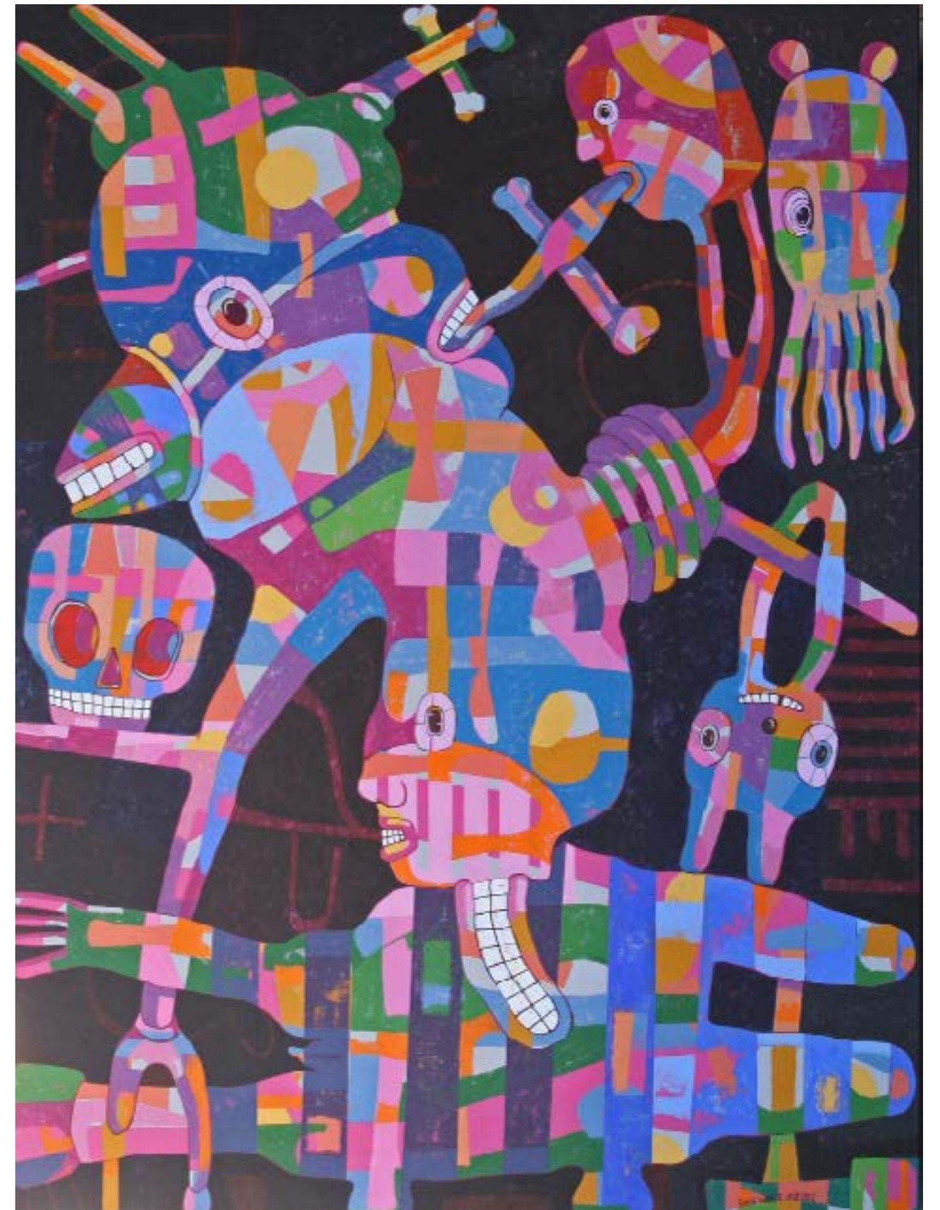
Eddie HARA, Outsider, 2012, Acryl auf Leinwand, 200 x 150 cm