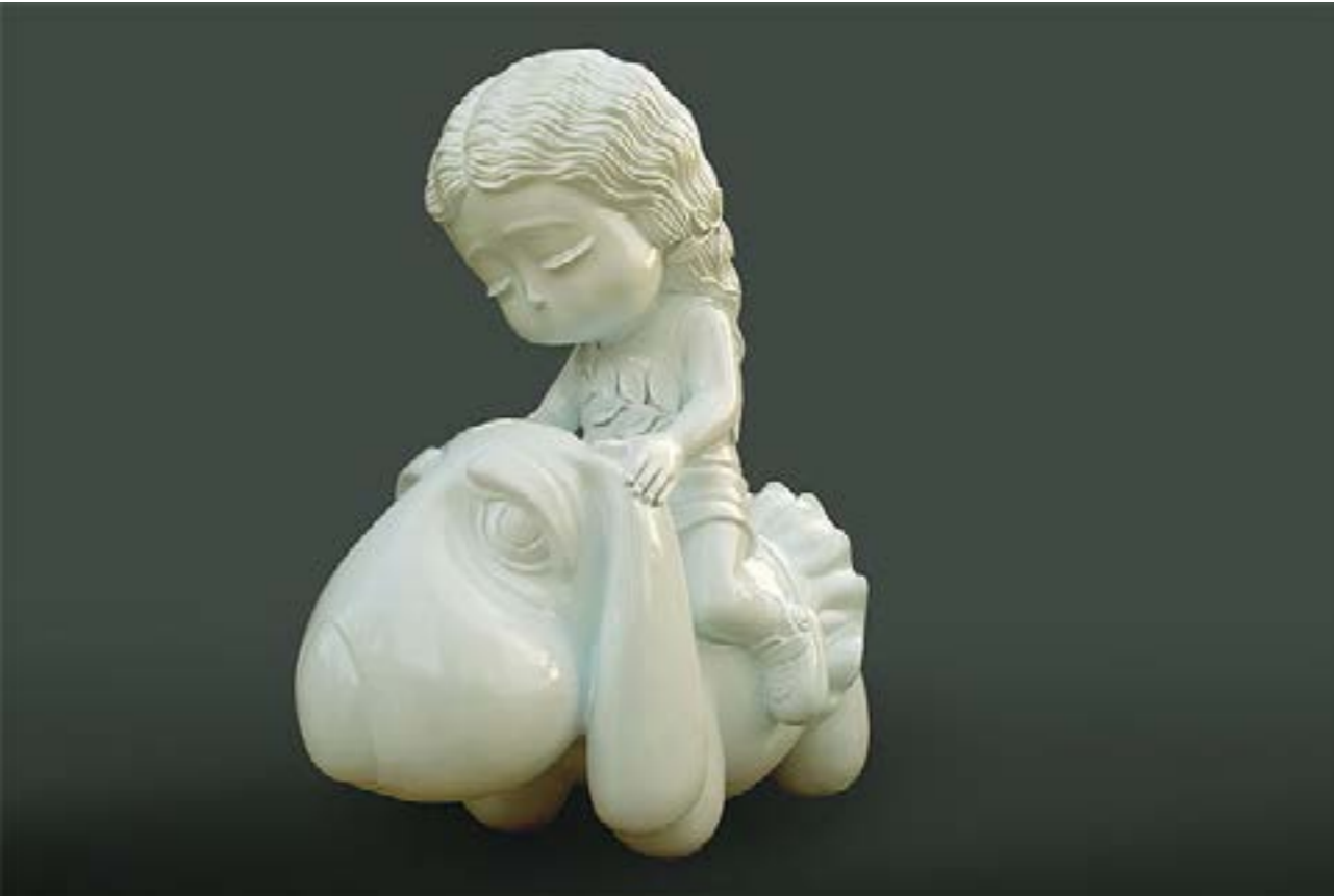
A. C. Andre Tanama, 2011, Tak Tahan Lagi, Painted Fiberglass, 90 x 80 x 45 cm