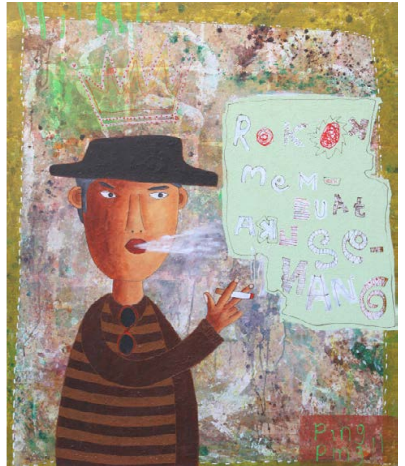
Ping Ping, Karena Rokok, Öl, Sand, Papier auf Leinwand, 120 x 100 cm