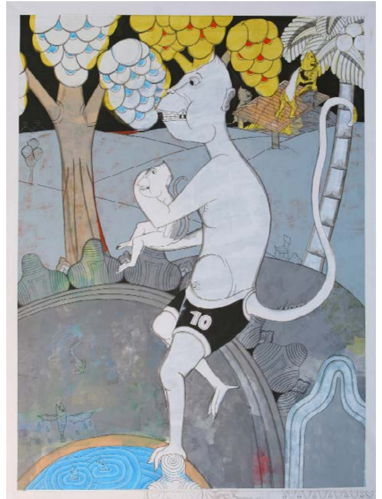
Teje Astawa, Monkey Forest, 2011, Öl auf Leinwand, 200 x 150 cm