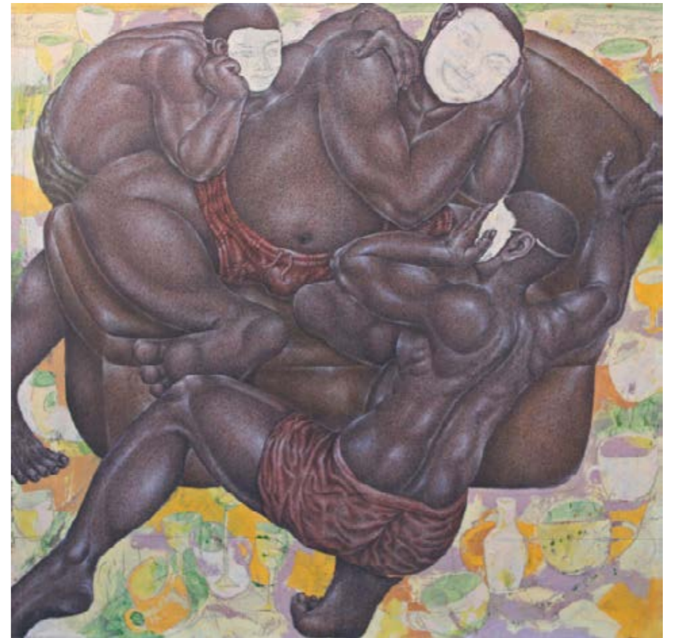
Wayan Kun Adharyana, Lust for Boss, 2011, Öl auf Leinwand, 145 x 150 cm