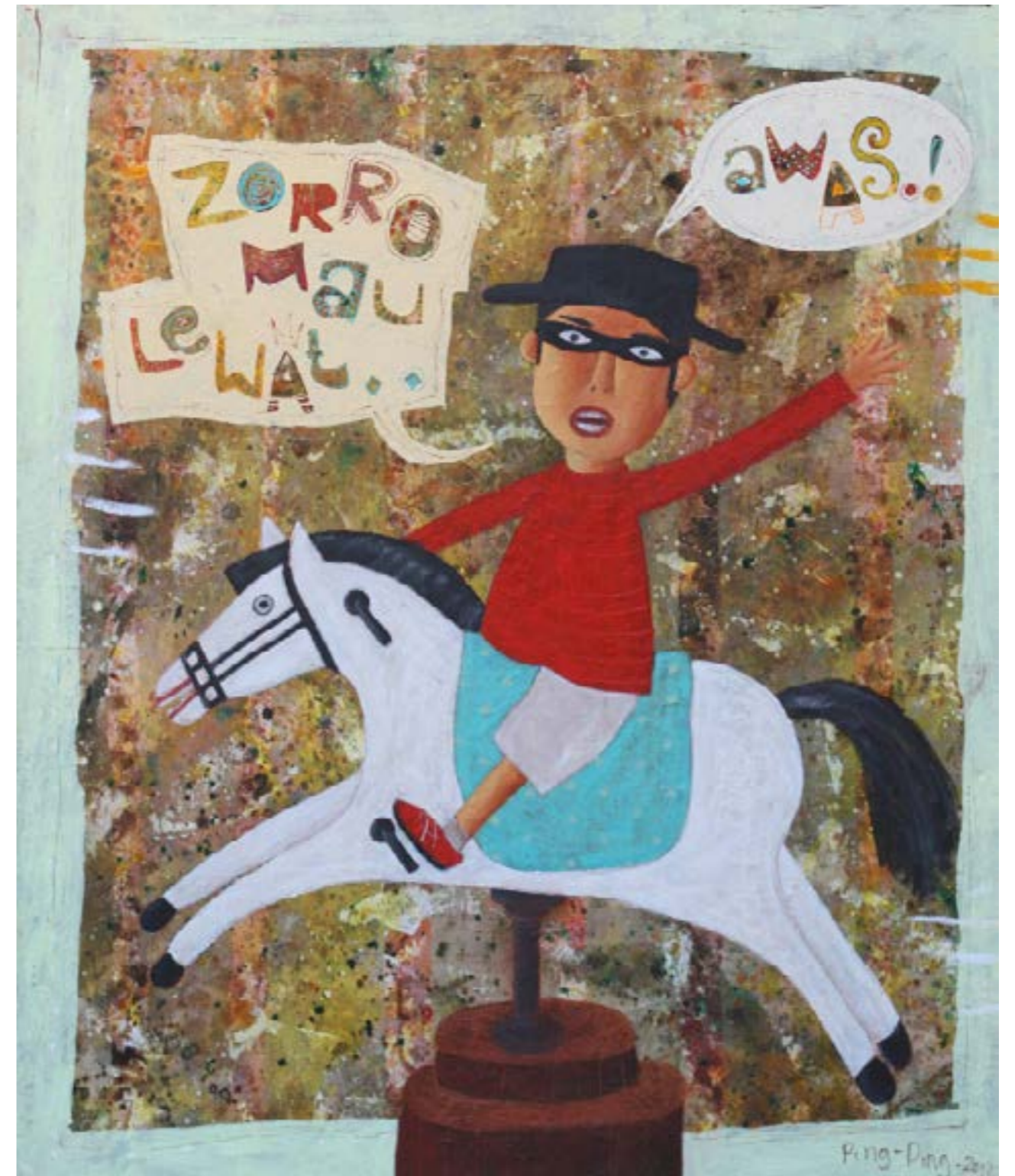
Ping Ping, Awass, Öl, Sand, Papier auf Leinwand, 120 x 100 cm