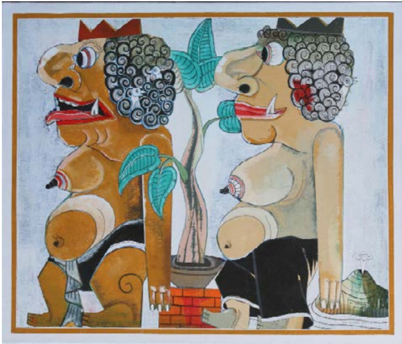
Teje Astawa, Couple, Öl auf Leinwand, 110 x 130 cm